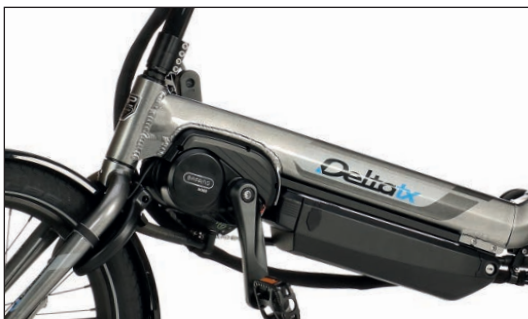
Let's go! Our basic model from BAFANG provides you with full power from the very first pedal stroke.