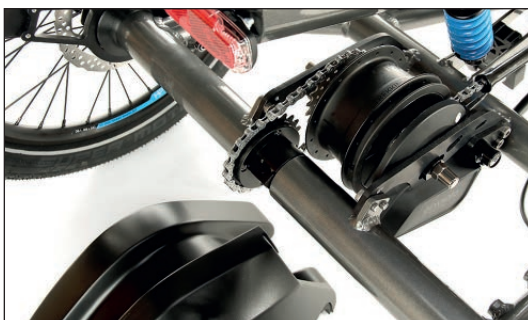
Undercover, but no secret: The cover at the rear protects the rotating parts of the intermediate gear.