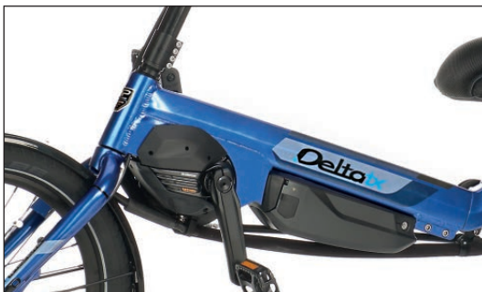
Lots of torque and full acceleration: The top model, the SHIMANO STEPS EP801 Cargo, ensures maximum riding pleasure.