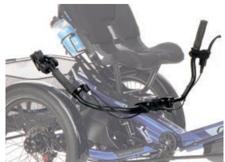
In addition to its relaxed hand position, the Delta tx® with Under Seat Steering offers even more advantages. Both the left and right handlebar sections can be folded away independently, making it much easier for riders with limited mobility to get on and off the trike.

Want to learn more about the Delta tx® and the wide range of options offered by our modular system? Your authorized dealer will be happy to advise you!