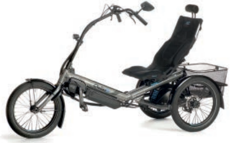
Prefer classic bicycle handlebars? Then simply choose the Delta tx® with Above Seat Steering . In this version, you will also enjoy the benefits of our comfortable e-chopper: excellent tipping stability, outstanding visibility, and a phenomenally relaxed riding experience!