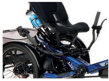
In addition to its relaxed hand position, the Delta tx® with Under Seat Steering offers even more advantages. Both the left and right handlebar sections can be folded away independently, making it much easier for riders with limited mobility to get on and off the trike.

Want to learn more about the Delta tx® and the wide range of options offered by our modular system? Your authorized dealer will be happy to advise you!