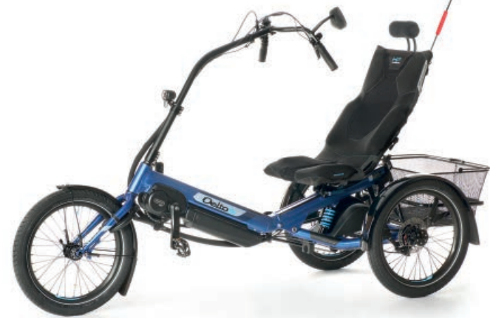
Delta tx Special Edition: equipped with BAFANG motor, ENVILO automatic hub, IQ-XS light, ErgoMesh seat, headrest, seat rain cover, luggage basket, frame lock, flag, mudguards, steel spring suspension damper, mirror, parking brake .. from € 7.990