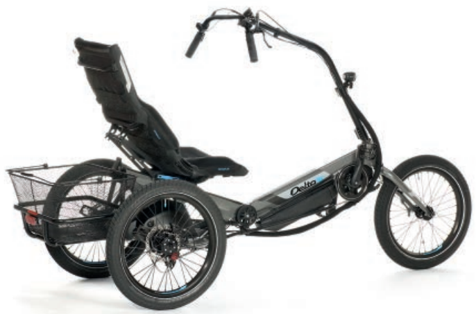
Delta tx in our modular system: combine your ideal comfort and everyday equipment and choose from the motor systems and gears as well as from a wide range of solutions for luggage transport ..... from € 6.490