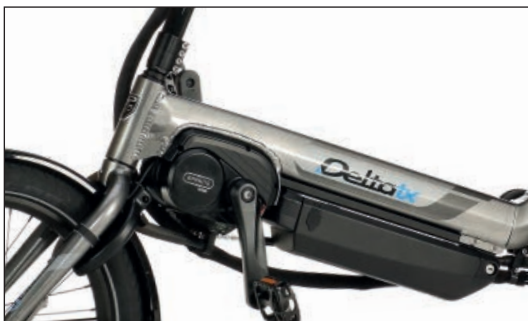
Let's go! Our basic model from BAFANG provides you with full power from the very first pedal stroke.