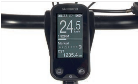
Always in view: Large display with information for SHIMANO E5000 and E6100 motors, centered on the handlebars. For EP801 cargo and BAFANG, a smaller display is mounted next to the handlebar grip.