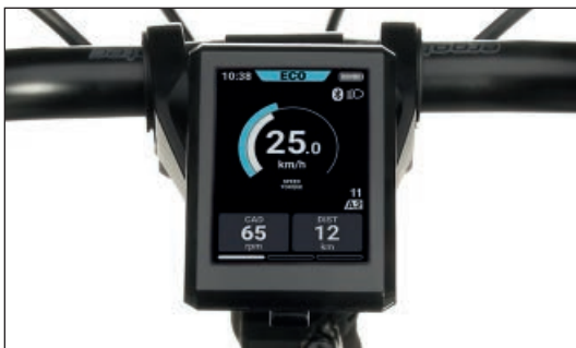
Always in view: The color display with all the important information for the SHIMANO motors EP5 and EP801. The display for the BAFANG motor is also mounted centrally on the handlebars.