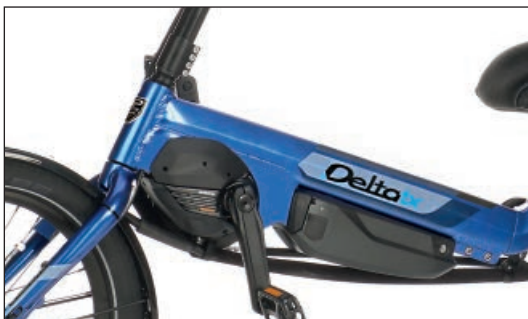
Lots of torque and full acceleration: The top model, the SHIMANO STEPS EP801 Cargo, ensures maximum riding pleasure.